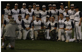
The Penn State DII Team poses with the 2011 NCBA DII National Championship Trophy after they defeated the University of Wyoming 13-11 in the Championship Game.