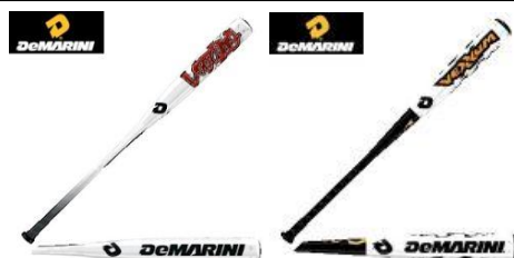
Images of the DeMarini Voodoo Black BBCOR and the DeMarini Vexxum BBCOR bats that each NCBA member team will be receiving in the fall.

The main difference between BESR and BBCOR testing is that BESR tested the exit