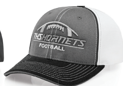
172 | Sport Mesh

CONTACT YOUR LOCAL DEALER FOR INFORMATION AND DETAILS.