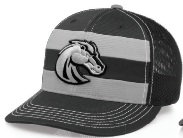
162 | Striped