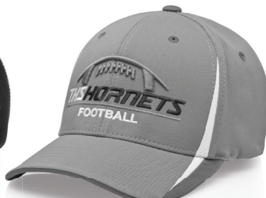
439 | Color Blocked