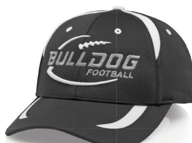
416 | Micro Mesh