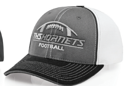
172 | Sport Mesh

CONTACT YOUR LOCAL DEALER FOR INFORMATION AND DETAILS.