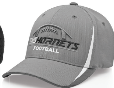
439 | Color Blocked